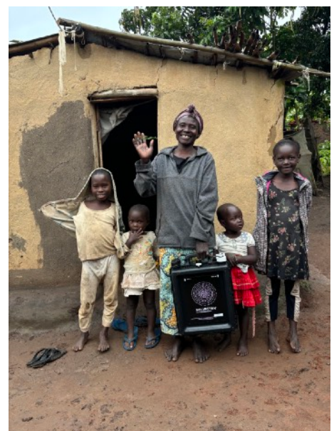
Colleagues at UNHCR and a happy family that has received a Solvatten in UNHCR's refugee settlement.